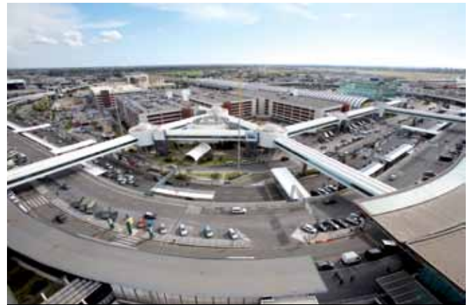
Rome's Fiumicino Airport

He added, "CAG is proud to be associated with AdR's ambitious plan to develop the airports into world-class assets. We will leverage our experience and expertise to assist AdR and look forward to working with the shareholders and management of Gemina and AdR to achieve the full development and commercial potential of the Rome airports."