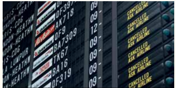
A huge volcanic ash cloud caused planes to be grounded across the world