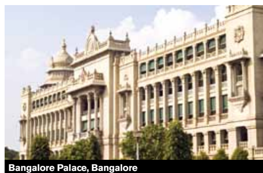
Bangalore Palace, Bangalore