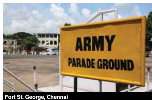
Fort St. George, Chennai

The three cities boast impressive tourist attractions such as the Purple Mountain in Nanjing, the majestic Bangalore Palace, and the historic Fort St. George in Chennai. Besides scenic and historical attractions, the cities also offer a myriad of shopping and entertainment options, ranging from traditional arts and crafts to trendy pubs and bars.