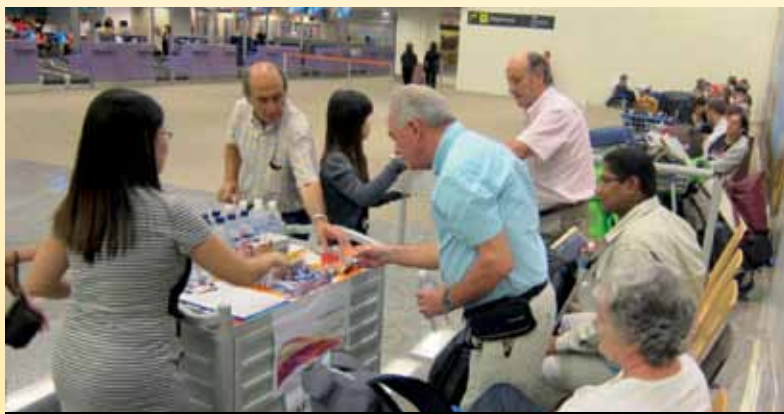
Affected passengers at T1 being served light refreshments