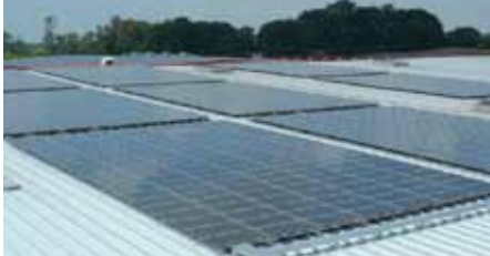
Solar photovoltaic (PV) panels installed on Budget Terminal rooftop

CAG has a number of environmentally friendly measures under its 'Changi Goes Green' programme. Various initiatives have been implemented, including dimming lights at airport terminals by as much as 50% during off-peak hours, and installing motion sensors in areas such as toilets and offices to conserve electricity when there is no activity.