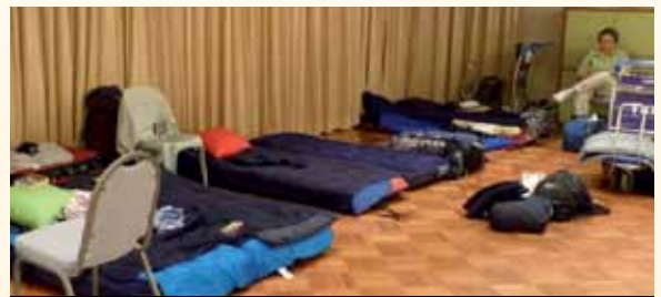
Passengers who had to wait at Changi were accommodated at a reserved resting area