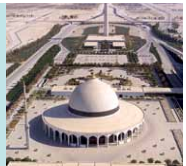
Dammam's King Fahd International Airport

China – CAI has completed a number of consultancy projects in China, including the design of the way-finding system in Shenzhen Bao An International Airport, as well as layout and retail planning for the new domestic terminal in Chengdu Shuangliu Airport.