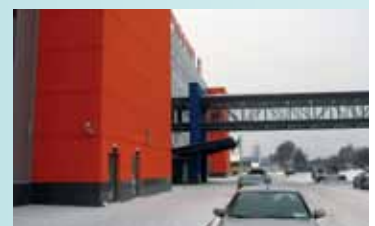
Moscow's Sheremetyevo International Airport