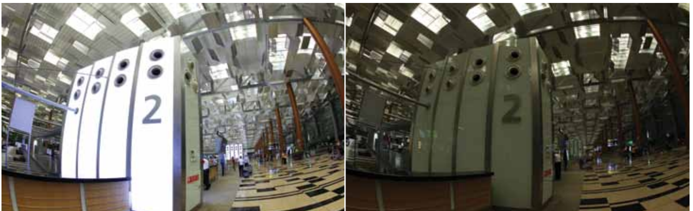
Lights at Terminal 3's Departure Hall and Departure/ Transit Mall were dimmed by 80%

Before and during Earth Hour, the green message was communicated to airport staff, passengers and visitors via displays on plasma screens and announcements over the airport's public address system. CAG also organised an internal campaign to encourage its staff to join in the effort at home.