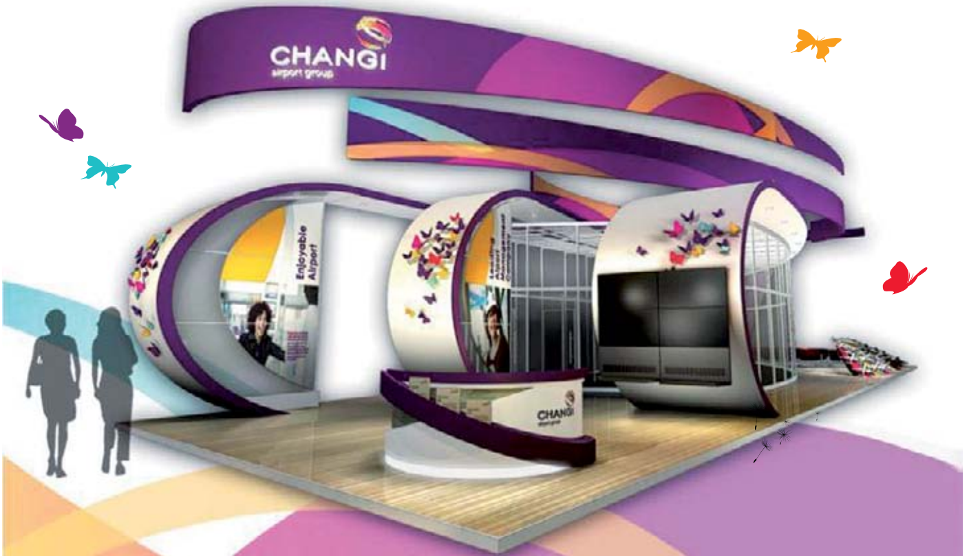
An artist's impression of CAG's booth at the Singapore Airshow 2010.

For the first time, Changi Airport Group (CAG) is participating at Singapore Airshow 2010, Asia's biggest aerospace and defence exhibition, and one of the world's top three aviation events. Occupying 208 sqm, the CAG booth features a walk-through garden featuring a variety of flowers and plants. In the glass enclosure, there will also be 200 to 300 butterflies of various species, providing visitors with an up-close experience, not unlike that provided by the Butterfly Garden at Changi's Terminal 3. Outside the garden, on-screen displays highlight new and popular features of Changi Airport, interesting facts about Changi's connectivity, the major attractions coming up in Singapore and a profile of CAG as a leading airport management company.