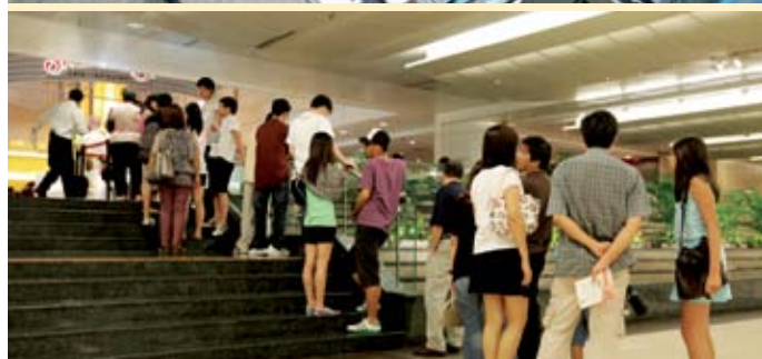
A crowd puller, Swensen's at Terminal 2 attracts crowds, especially on weekends and public holidays

Swensen's has been very much part and parcel of Changi Airport's history, opening its first restaurant at Terminal 1 in 1981, the year the airport started operations. The American casual dining concept restaurant relocated to its present location at Terminal 2's Arrival Level in 2005. Last year, Earle Swensen's, another restaurant concept under the Swensen's stable, opened at Terminal 3.