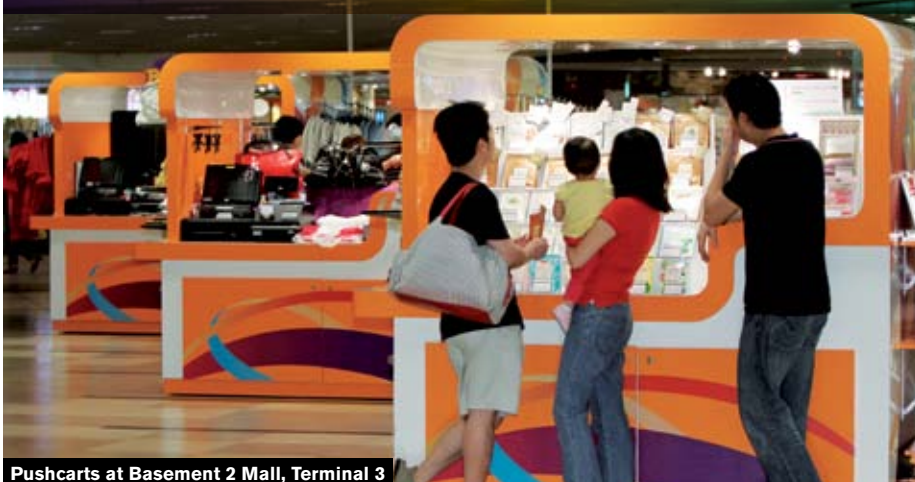
Pushcarts at Basement 2 Mall, Terminal 3